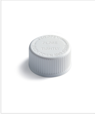
24 mm SecuRx® Ribbed Side Text Top CRC