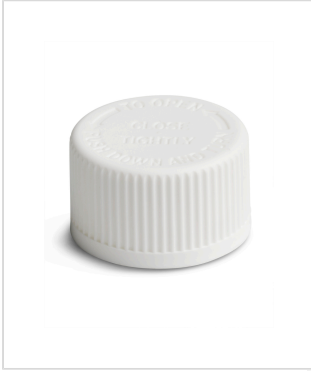
20 mm SecuRx® Ribbed Side Text Top CRC