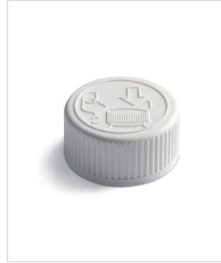
28 mm SecuRx® Ribbed Side Pictorial Top CRC