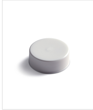
28 mm Continuous Thread Ribbed Side Smooth Top