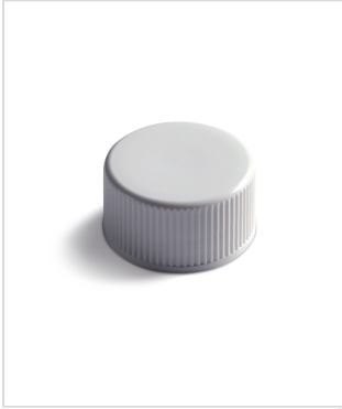
28 mm Continuous Thread Ribbed Side Smooth Top