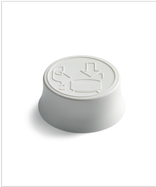
28 mm SecuRx® Cone Smooth Side Pictorial Top CRC