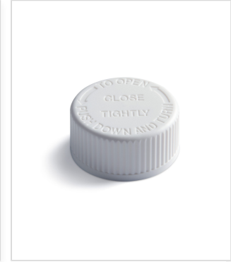
28 mm SecuRx® Ribbed Side Text Top CRC