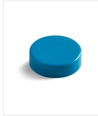
38 mm Continuous Thread Smooth Side Smooth Top