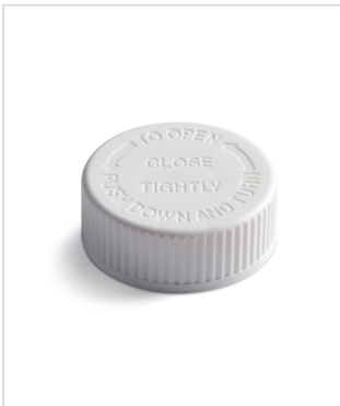
38 mm SecuRx® Ribbed Side Text Top CRC