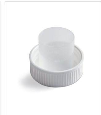
38 mm SecuRx® 15ml Dosage Cap™ with Ribbed Side Text Top