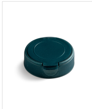
38 mm THUMBLE- EZY® Dispensing Top with Raised Ring