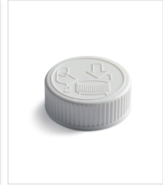
38 mm SecuRx® Ribbed Side Pictorial Top CRC