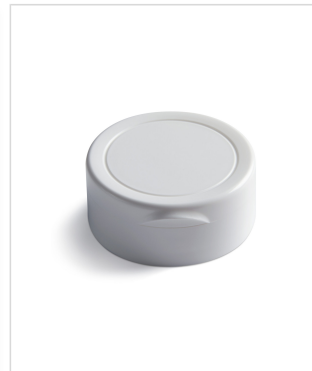
38 mm THUMBLE- EZY® III Dispensing Top