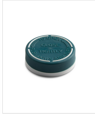
45 mm SecuRx® GripMax™ Text Top CRC