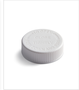
45 mm SecuRx® Ribbed Side Text Top CRC