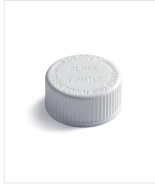
28 mm SecuRx® Ribbed Side Text Top CRC