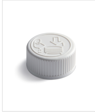
28 mm SecuRx® Ribbed Side Pictorial Top CRC