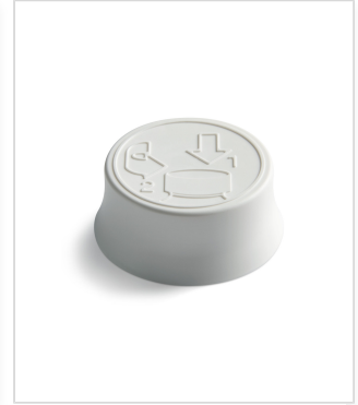
28 mm SecuRx® Cone Smooth Side Pictorial Top CRC