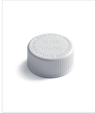
28 mm SecuRx® Ribbed Side Text Top CRC