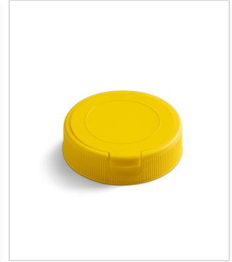
45 mm THUMBLE- EZY® Dispensing Top with Raised Ring