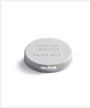
38 mm Snap Cap Text Top CRC